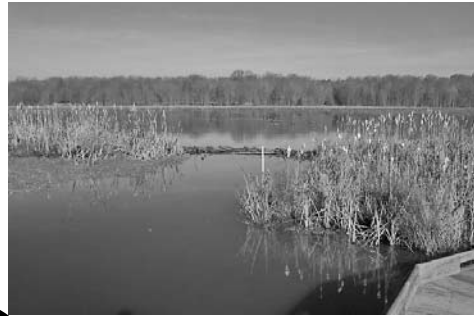
8. Dec - Looks like it's been a quiet year