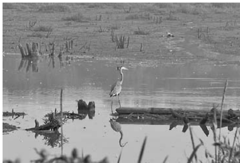
4. Aug - dam destroyed