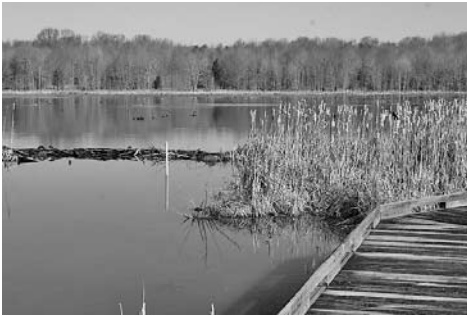
1. Feb - wetlands full