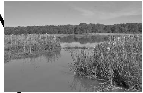
7. October - work continues