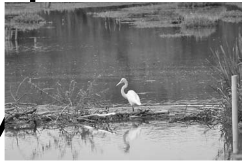
6. Late Sept - rebuilding begins