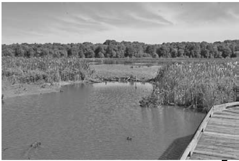
2. Early June - water down