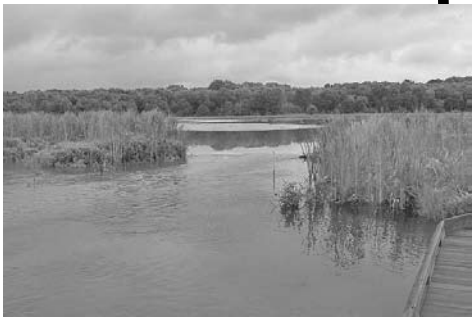
3. Late June - major flood